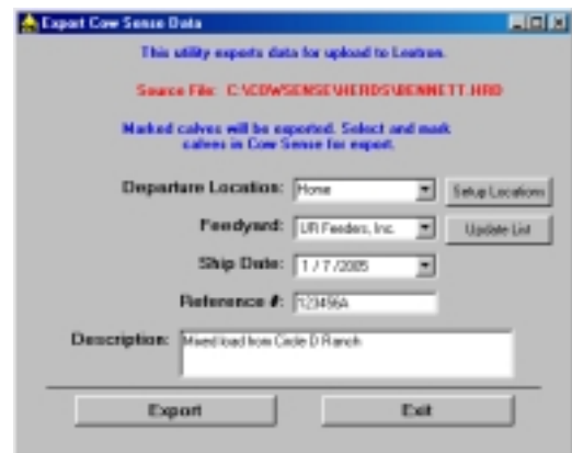
(Example of Beef Star exchange with registered Feedlots)